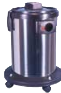
CWP-332M (A or B) Stainless Commercial Wet Pick-Up. Includes MC-32 Mobile Cart, hose and cuffs. Approx. 5 gallon capacity