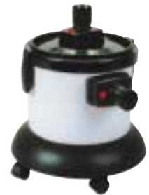
ICC-302B Restaurant Interceptor Approx. 4 Gallon Capacity Supplied with hose and cuffs ICC-302 Restaurant Interceptor Supplied with NO hose or cuffs

A Style = 1-1/4" Connections B Style = 1-1/2" Connections