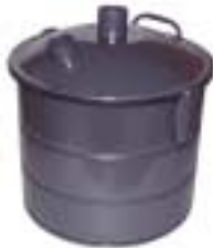
ICC-102G Galvanized Interceptor Canister Approx. 4 Gallon Capacity

NOTE: WHEN USING OTHER THAN 1-1/4" HOSE FROM CANISTER TO TOOL, SPECIFY THE DIAMETER OF THE HOSE TO BE USED WITH THE WET PICK-UP. WHEN 1-1/2" OR 1-3/8" INLETS ARE USED, THEN USE IH-205, 1-1/2" X 5' HOSE WITH TWO IHV-160 CUFFS.