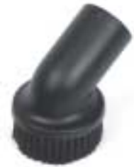
IDB-95 Round Dusting Brush