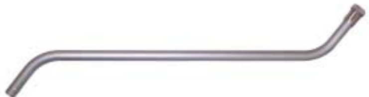
IWA-24 48" Double Curved Industrial Aluminum S-Wand Fits IHV-159 (1-1/2") and HC-111G (1-1/4") Cuffs