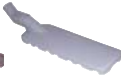
IFB-002 Large Surface Rug Tool (Use with W-219 Wands)