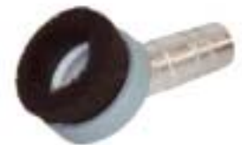
IDB-306 Metal Heavy Duty Dusting Brush 1-1/4" and 1-1/2" (Use IHV-159 & IHV-160 Cuffs for 1-1/2" & HC-111 Cuff for 1-1/4" )