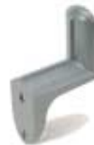
H-431 New Plastic Hose Hanger