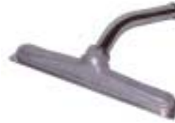
IRT-434 14" Wide Metal Rug Tool (Use with W-219 Wands)