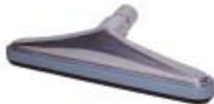
ISV-645 14" Metal Squeegee (Fits S-Wands)