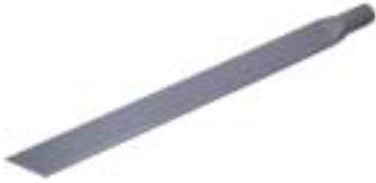
ICT-626 28" Long Industrial Crevice Tool Fits IHV-159 and HC-111G Cuffs