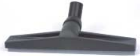
ISV-385 16" Squeegee Brush (Fits IWP-87 Wands)