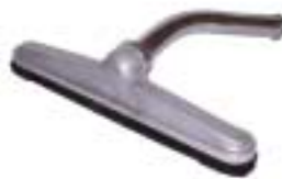
IFB-433 14" Wide Metal Floor Tool (Use with W-219 Wands)