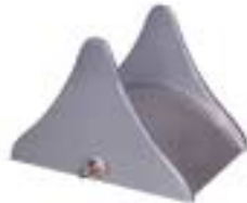
SSS-186-4 Hose Hanger SSS-186-4-S Hose Hanger with Switch