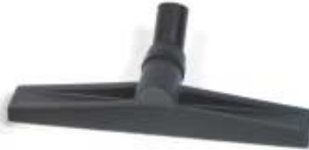
IFB-386 16" Carpet/Rug Tool (Fits IWP-87 Wands)