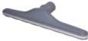
IFB-535-M 14" Plastic Rug Tool (Fits S-Wands)