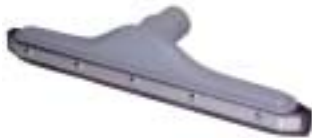
ISV-545 14" Plastic Squeegee (Fits S-Wands)