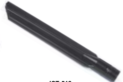
ICT-512 15" Long Crevice Tool