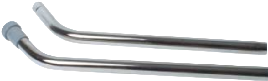
IWC-63 Chrome 2 Piece S-Wand (Tools available on pg. 13)