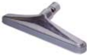
IRT-646 14" Metal Rug Tool (Fits S-Wands)