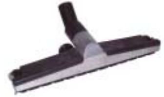
FBA-370 14" Long Adjustable Plastic Floor Brush (Fits W-219 Wands)