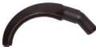
PDB-200 Plastic Pipe Dusting Brush for 6 inch pipe (Fits W-218RG and W-219 Wands)