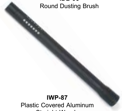
IWP-87 Plastic Covered Aluminum Straight Wands