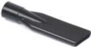
ICT-003 Short Crevice Tool