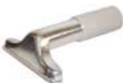
IW-223 Handi-Tool for 1-1/4" Hose (NOTE: Handi-tools fit directly on hose)