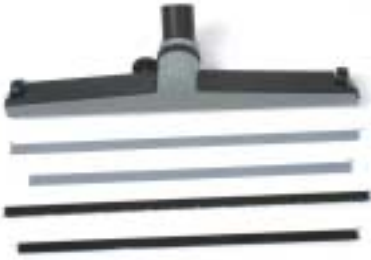
FBA-400 18" Adjustable Plastic Rug Tool with Hard Floor and Squeegee Inserts (Fits IWP-87 Wands)