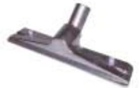
MRT-525 12" Metal Rug Tool (Use with W-219 Wands) (MRT-525-1 Complete Brush Insert)