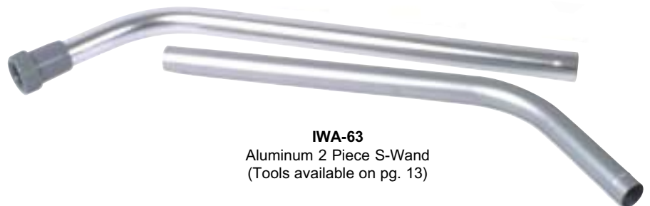
IWA-63 Aluminum 2 Piece S-Wand (Tools available on pg. 13)