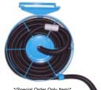
*(Special Order Only Item)* HR601320 Hanging Hose Reel with 1-1/4" Hose HR601380 Hanging Hose Reel with 1-1/2" Hose