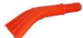
IUT-200 Upholstery Car Tool - Orange color with wide mouth (Fits IHV- 159, IHV-160, and HC-111 Cuffs)