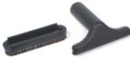
IUT-511B Upholstery Tool with Brush