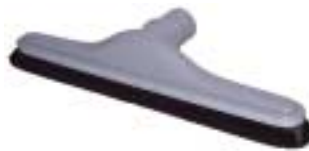
IFB-535 14" Plastic Floor Brush (Fits S-Wands)