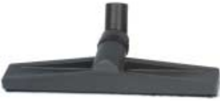
IFB-384 16" Hard Floor Brush (Fits IWP-87 Wands)