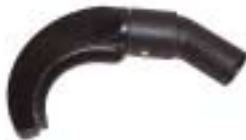
PDB-100 Plastic Pipe Dusting Brush for 3 inch pipe (Fits W-218RG and W-219 Wands)