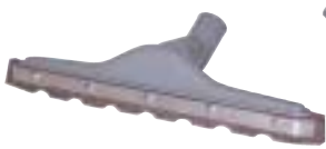
IFB-001 14" Wide Felt Floor Brush (Use with W-219 Wands)