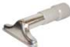
IW-224 Handi-Tool for 1-1/2" Hose (NOTE: Handi-tools fit directly on hose)